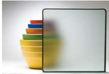
Outboard: SunGuard SuperNeutral 68 on Clear Inboard: SatinDeco Clear