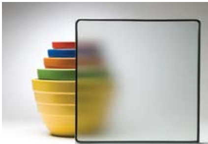
Outboard: SunGuard SuperNeutral 68 on UltraWhite Inboard: SatinDeco Low Iron