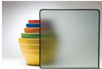
Outboard: SunGuard AG 50 on Clear Inboard: SatinDeco Clear