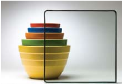
Outboard: SunGuard SuperNeutral 68 on Clear Inboard: Clear

PRIVACY. DIFFUSED NATURAL LIGHT. ENERGY SAVINGS.